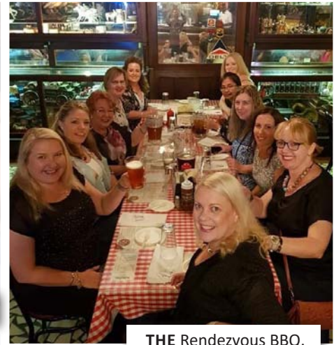
THE Rendezvous BBQ.