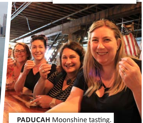
PADUCAH Moonshine tasting.