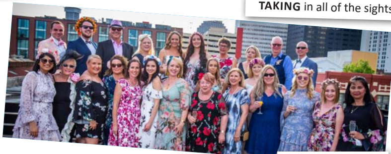
GEARING up for all of the fun of the New Orleans Gala.