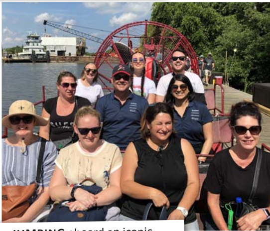
JUMPING aboard an iconic swamp boat tour in New Orleans.