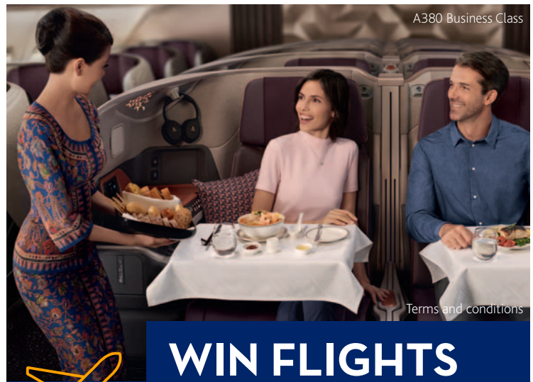
A380 Business Class

In addition, Excite is giving away a US$100 Simon Shopping voucher to the first 50 agents who make a paid US booking for at least five nights.