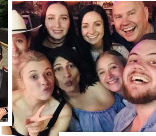
HONKY Tonks in Nashville.