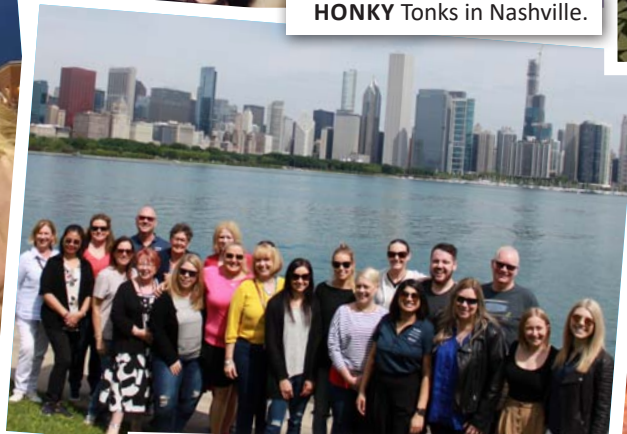
TAKING in all of the sights in Chicago.