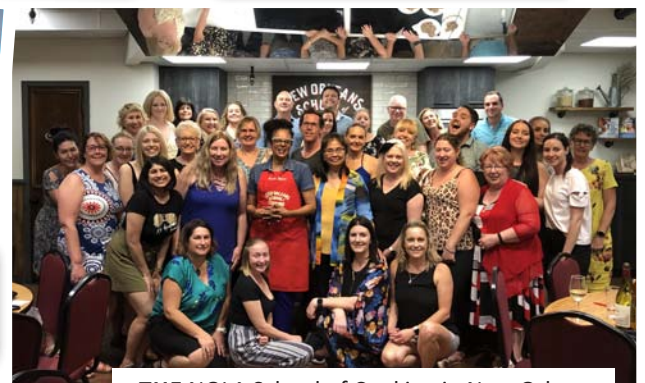
THE NOLA School of Cooking in New Orleans.