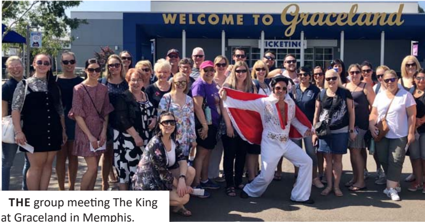
THE group meeting The King at Graceland in Memphis.

This could be you next year - don't forget all Globus, Cosmos, Avalon Waterways and Monograms passengers booked from 01 Mar 2019 count towards Supertour 2020.