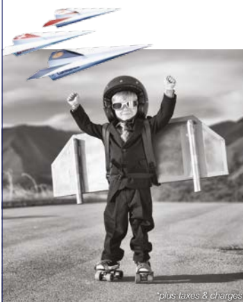
*plus taxes & charges

Reach over 170 destinations in Europe via any one of our multiple Asian gateways.