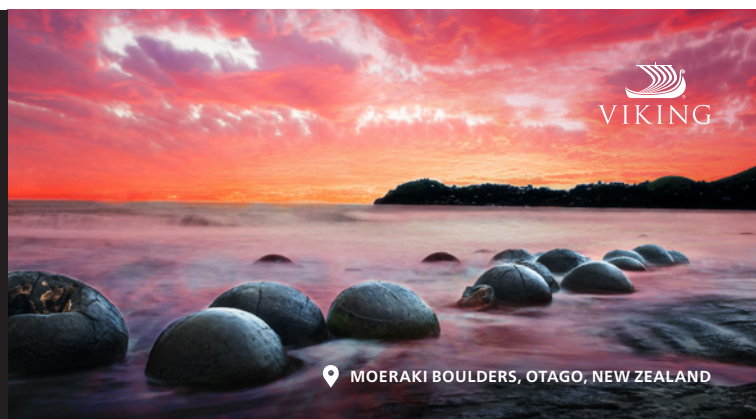
MOERAKI BOULDERS, OTAGO, NEW ZEALAND