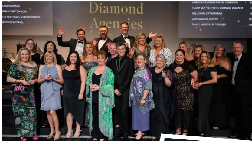
2019 Diamond Award Winning Agencies.