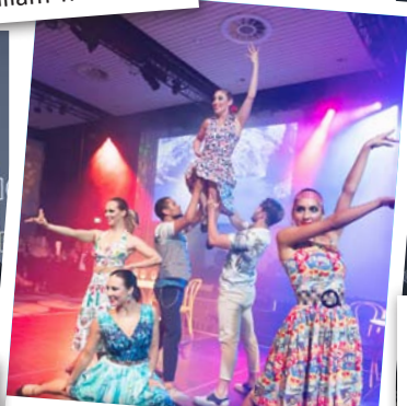
MEDITERRANEAN-STYLE dance performance.