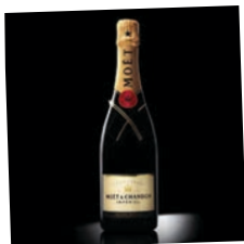
Buy some bubbly Moët