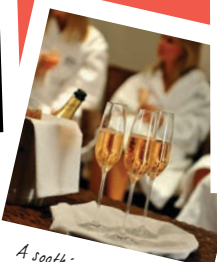
A soothing day at a spa