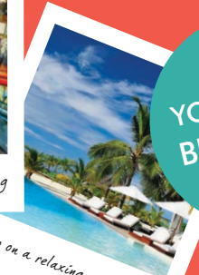
Go on a relaxing getaway